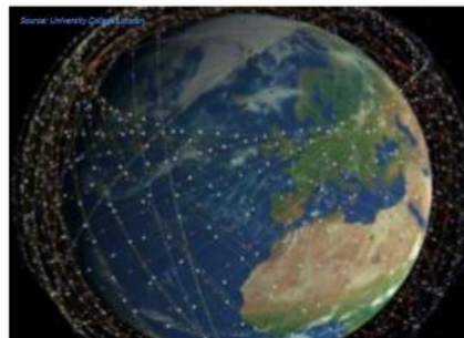
An illustration of what the Starlink satellites will look like, showing 4,400 satellites from the project's first phase.

Not everyone is happy about the Starlink project, including some astronomers at the Rubin Observatory in Chile, who have said that the satellites are affecting between 30% and 50% of observations. SpaceX have said that they are looking to reduce the brightness of the satellites over time.