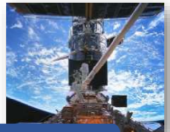
This image shows Hubble's Space Telescope Imaging Spectrograph, which astronauts installed in February 1997.

The Outer Space Treaty was written in 1967, over 50 years ago! Some people believe that the treaty does not provide enough regulation, or the regulation is not clear enough for newer space activities such as space tourism, lunar and asteroid mining.