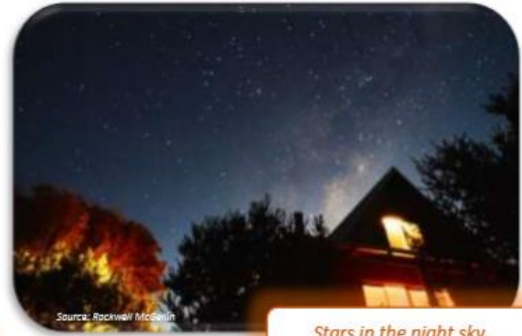
Stars in the night sky.