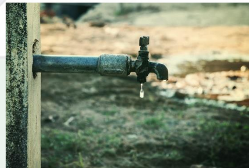
No running water