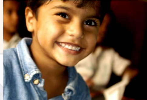
No electricity for TV, enjoy reading books from the mobile library.