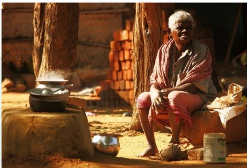
Cooking on an open fire