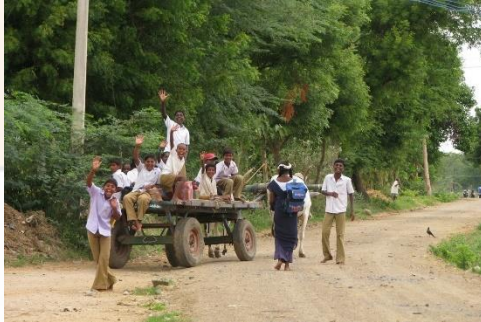
The children walk through the forest, then catch the 'bus' to school in the nearest town.