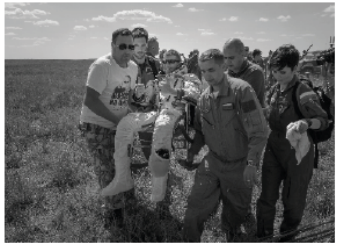
Landing with a bump! Tim Peake lands safely in Kazakhstan.

Having circled the planet nearly 3,000 times, the crew returned home to Earth in a capsule, which reached speeds of up to 28,000 kilometres per hour. The touchdown was bumpy due to high winds. However the astronauts landed safely in Kazakhstan, all returning in good health. Having arrived back on solid ground, the astronauts were pulled out of the capsule and carried as their leg muscles were too weak to walk. While sitting in their space suits, the men were checked over by medical staff. During these checks, Peake