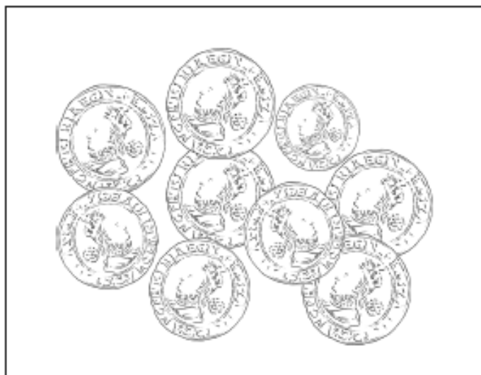
The treasure was discovered in a garden in Somerset.

Further excavations took place but no other finds were made. It is yet to be decided where the coins will be put on display for the public.