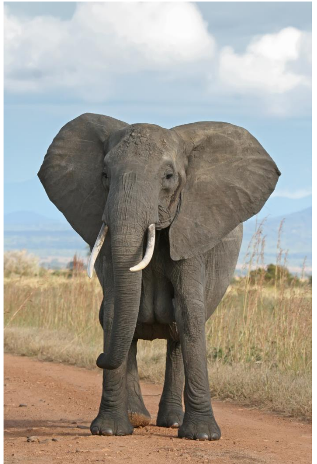
A bull elephant

Elephants are usually very gentle but can get quite cross. Elephants are very clever and know how to find water even when it is far away. When they find water they like to swim.