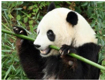
A giant panda eating bamboo.

Pandas are very fussy eaters. Most pandas only eat bamboo, a type of grass. A giant panda will eat half their own weight in bamboo every day.