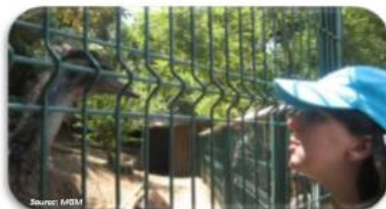
A zoo visitor

I enjoy visiting the zoo and am happy that my entrance fee will be used to look after the animals and for research.