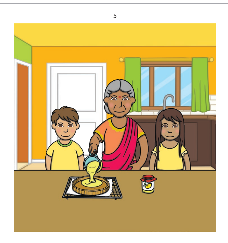
This is how to put in the curd.