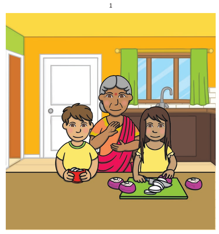
Can you cut up the turnip?