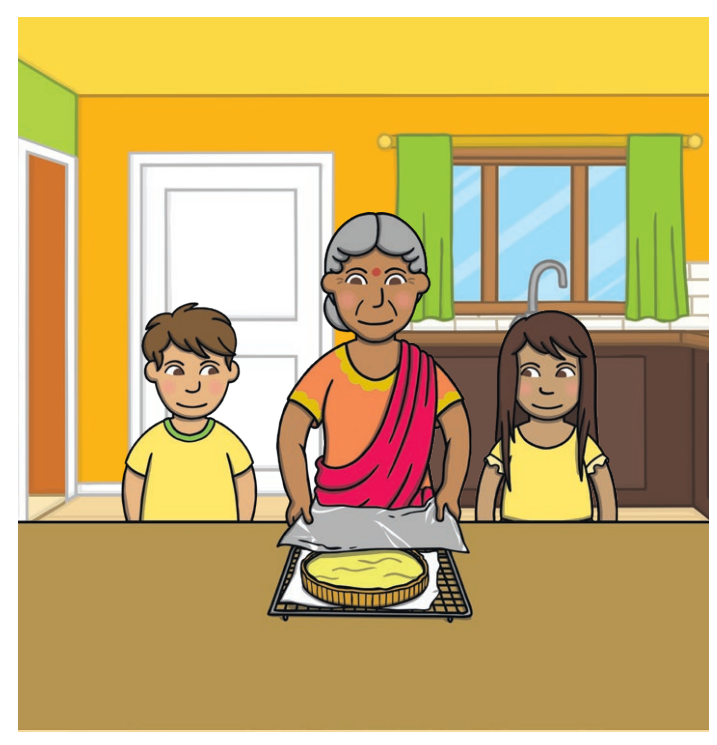
Then we need to put on this tinfoil.