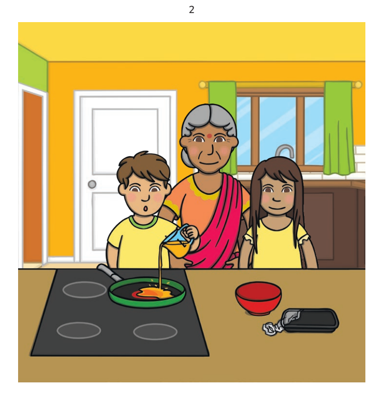
Will you put the oil in that pan?