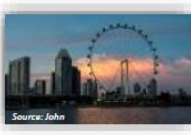
Pictured below: typical holiday destinations.

Can you think of any other reasons why people go on holiday? Why do you go on holiday?