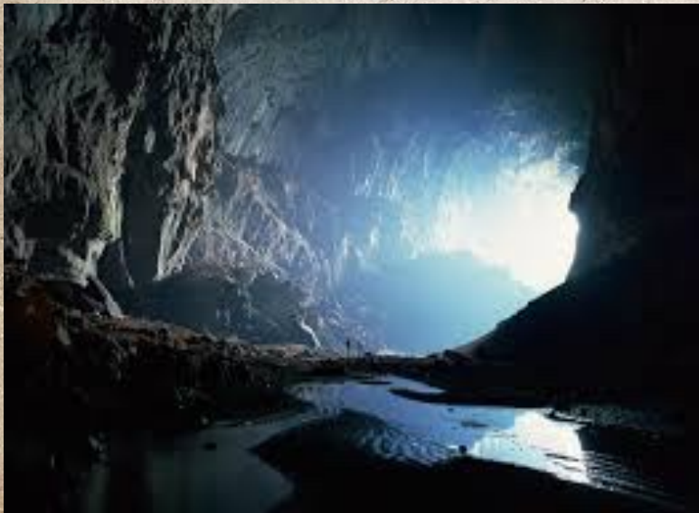
This is a cave

In the Stone Age, they had three different houses. In the Paleolithic, they had caves and they had to put fire outside the cave so animals ran away. They also had to keep moving from cave to cave because their prey would have kept moving. In the Mesolithic, they made animal skin tents. They did that by killing animals and scraping the skin off them. Finally in the Neolithic, they had permanent houses and they were made out of wattle and daub. Also, in the Neolithic they had farms.