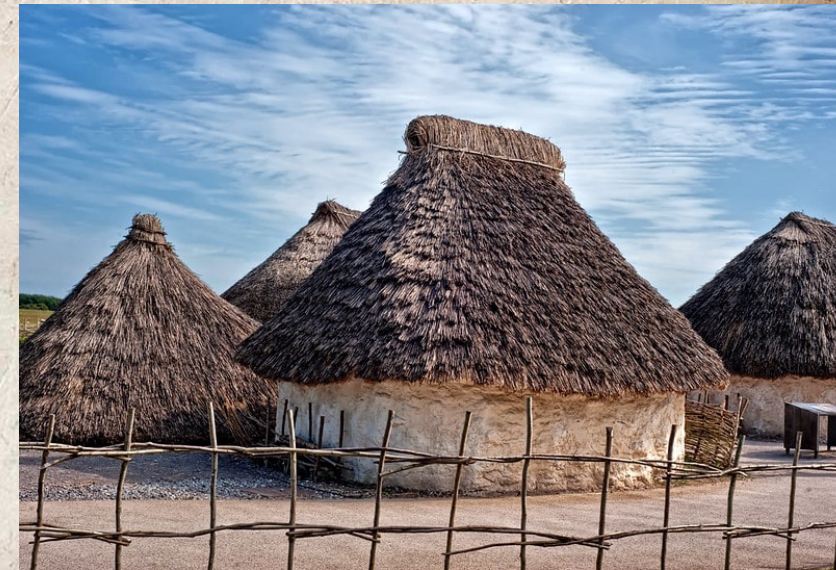
This is a permanent house