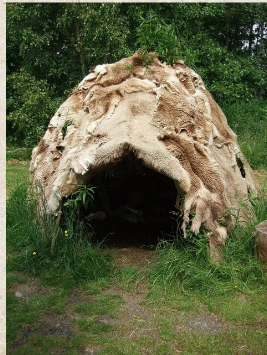
This is an animal skin tent