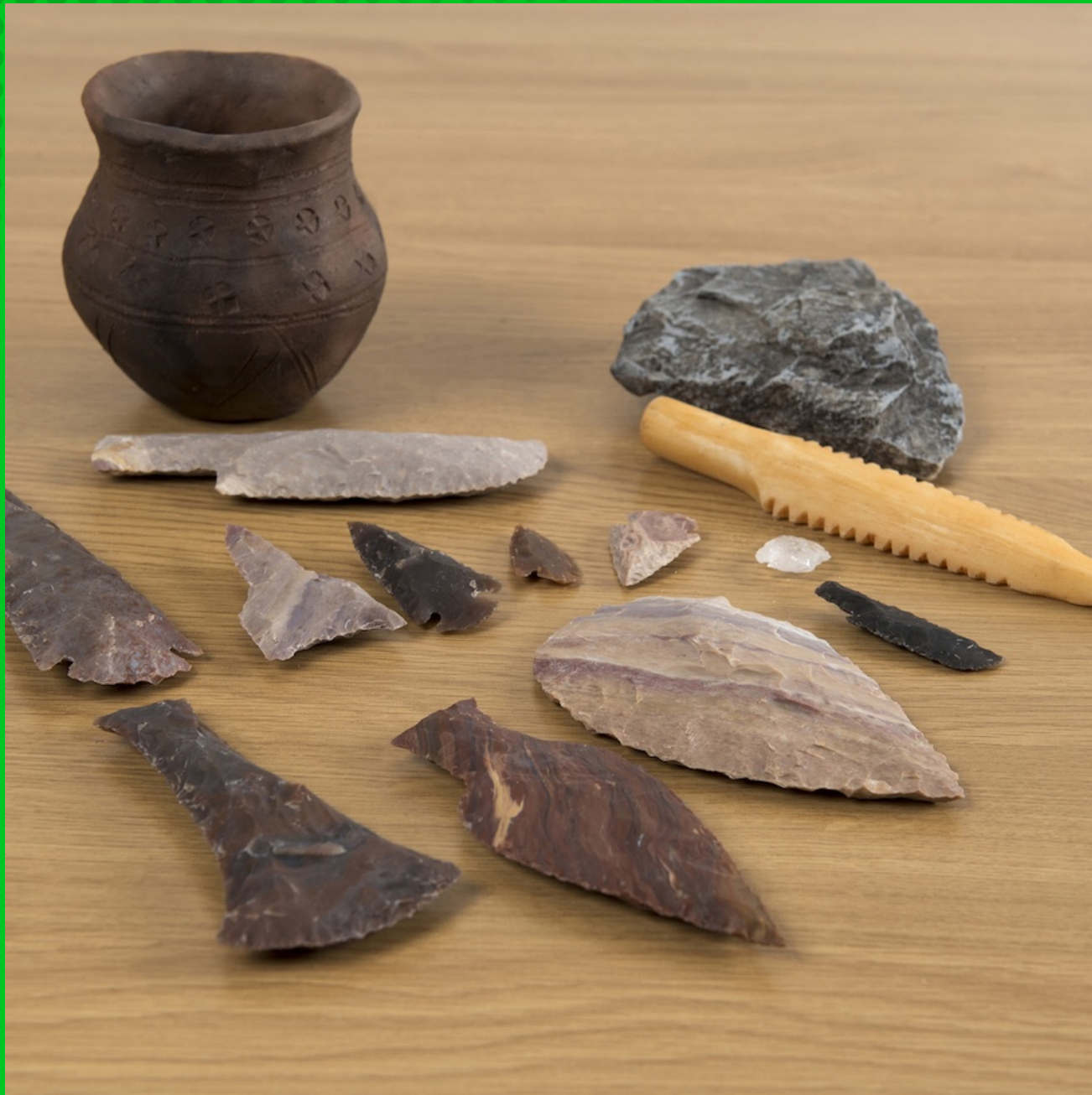
This is a picture of Stone Age tools!

In the Palaeolithic era they used to hunt for mammoths , deer ,bore and woolly rhinos . In the Palaeolithic Age, they had hunter gatherers a hunter gatherer is more than one hunter hunting together . The Stone Age people thought woods ,florists and in rivers where good places to hunt and streams they stabbed the spears in the stream hopefully they will catch one . Then the Neolithic came and they started farming.