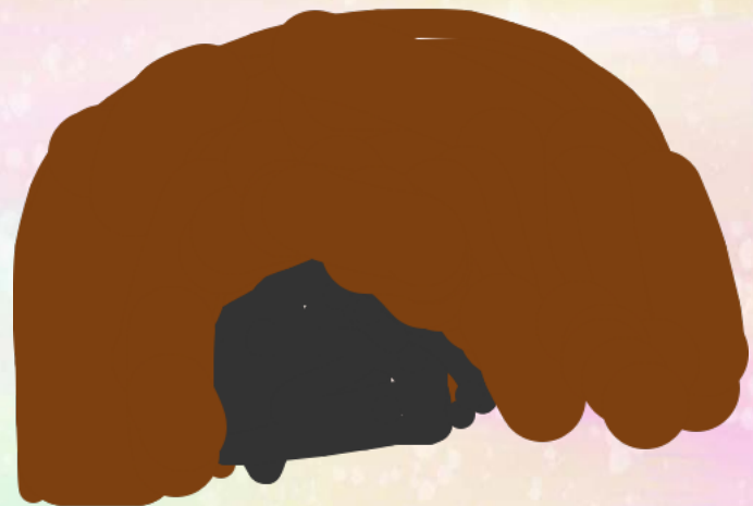
This a cave.

In the Palaeolithic era, they lived in huge caves. They kept moving caves because they had to follow their prey. In the Mesolithic era, they lived in animal skin tents but still had to move. In the Neolithic era, they lived in permanent houses and farms.