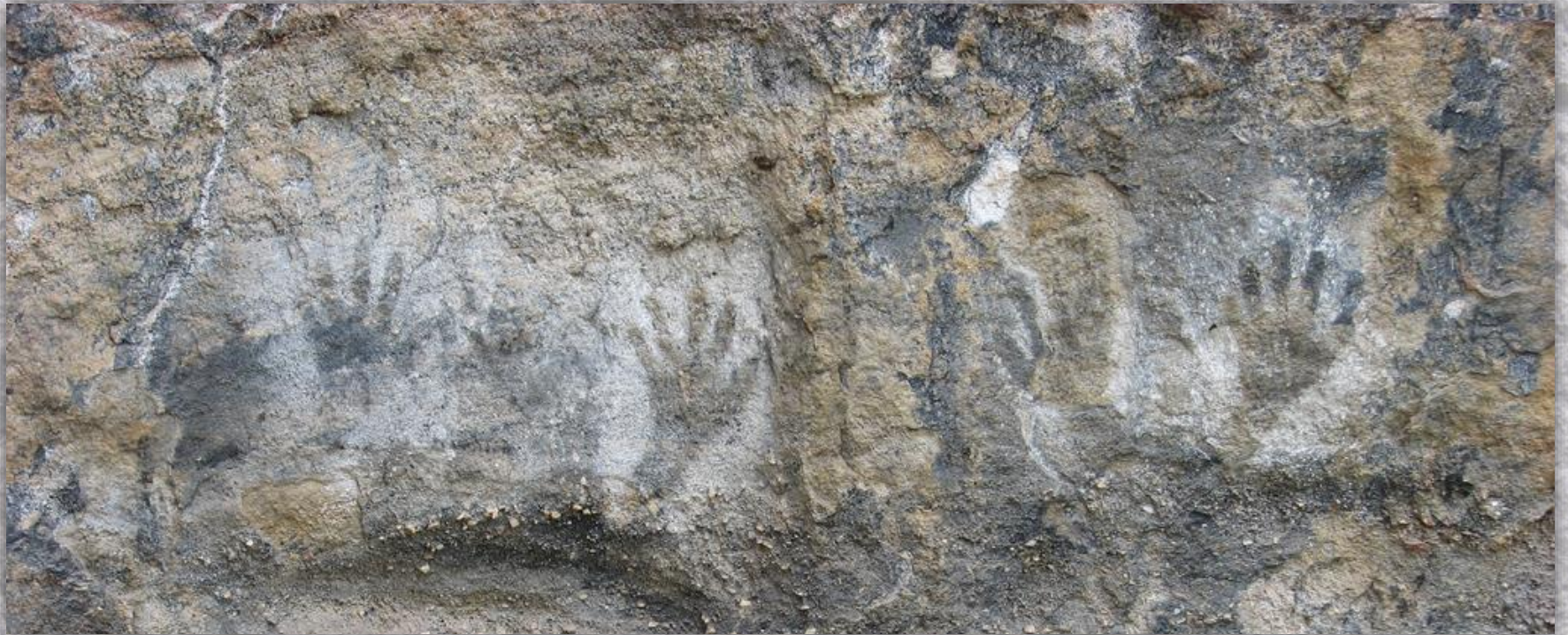
Photo courtesy of botheredbybees(@flickr.com) - granted under creative commons licence - attribution