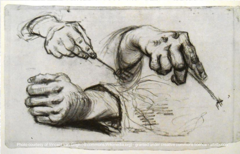
Photo courtesy of Vincent van Gogh (@commons.wikimedia.org) - granted under creative commons licence - attribution

Artists such as Vincent van Gogh and Leonardo Da Vinci use line and cross-hatching to create tone and highlights making a drawing appear realistic and 3-dimensional.