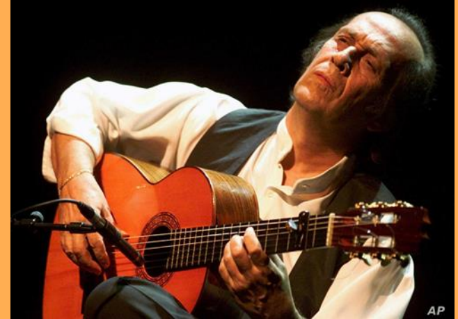
Toque (playing guitar)