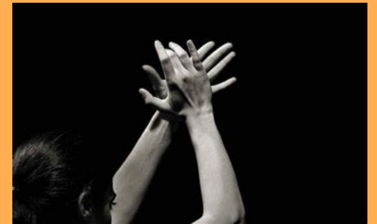
Palmas and jaleos (hand-clapping and shouts for encouragement)