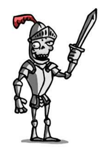
Knight of the living dead