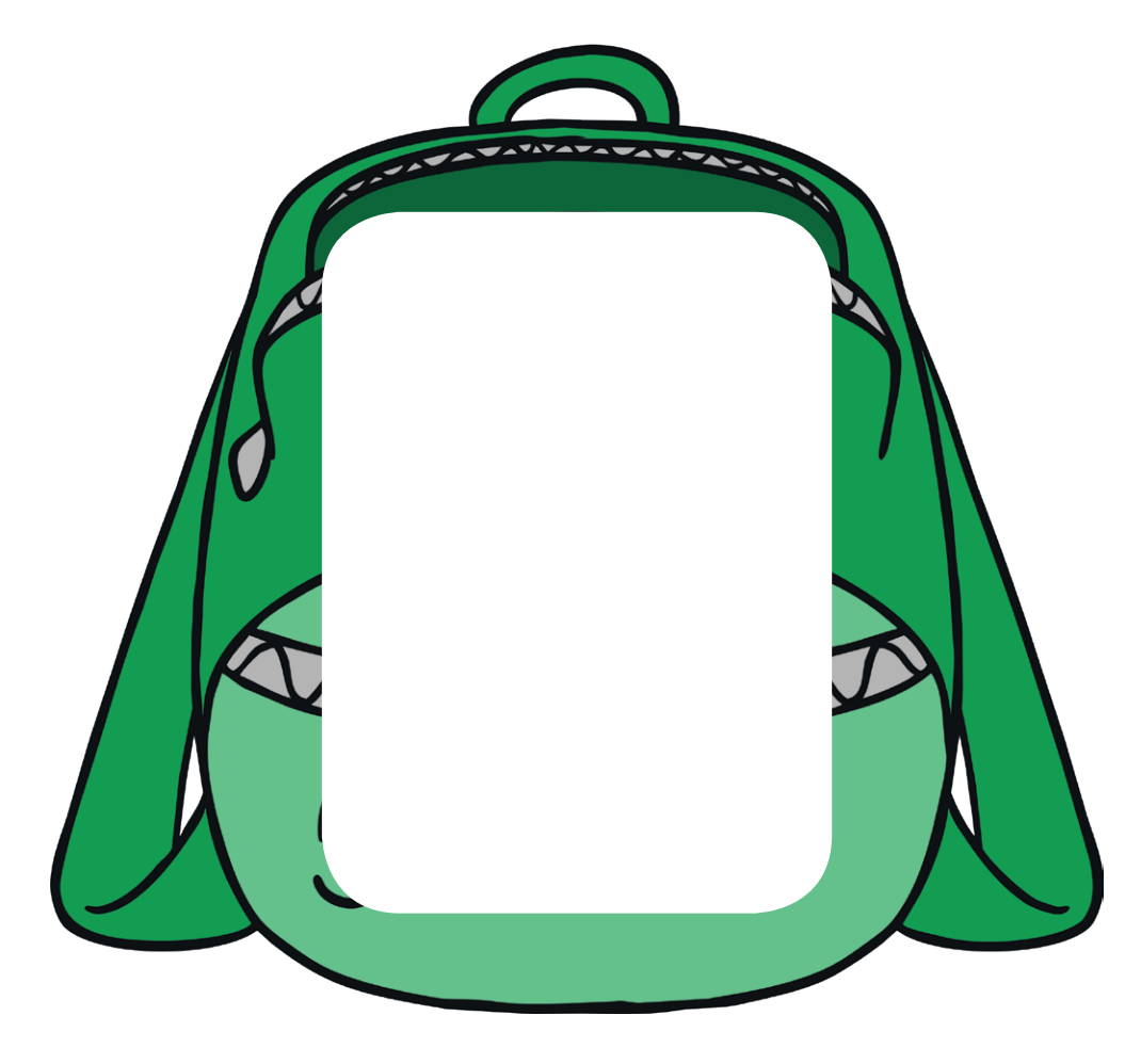
Real ou words