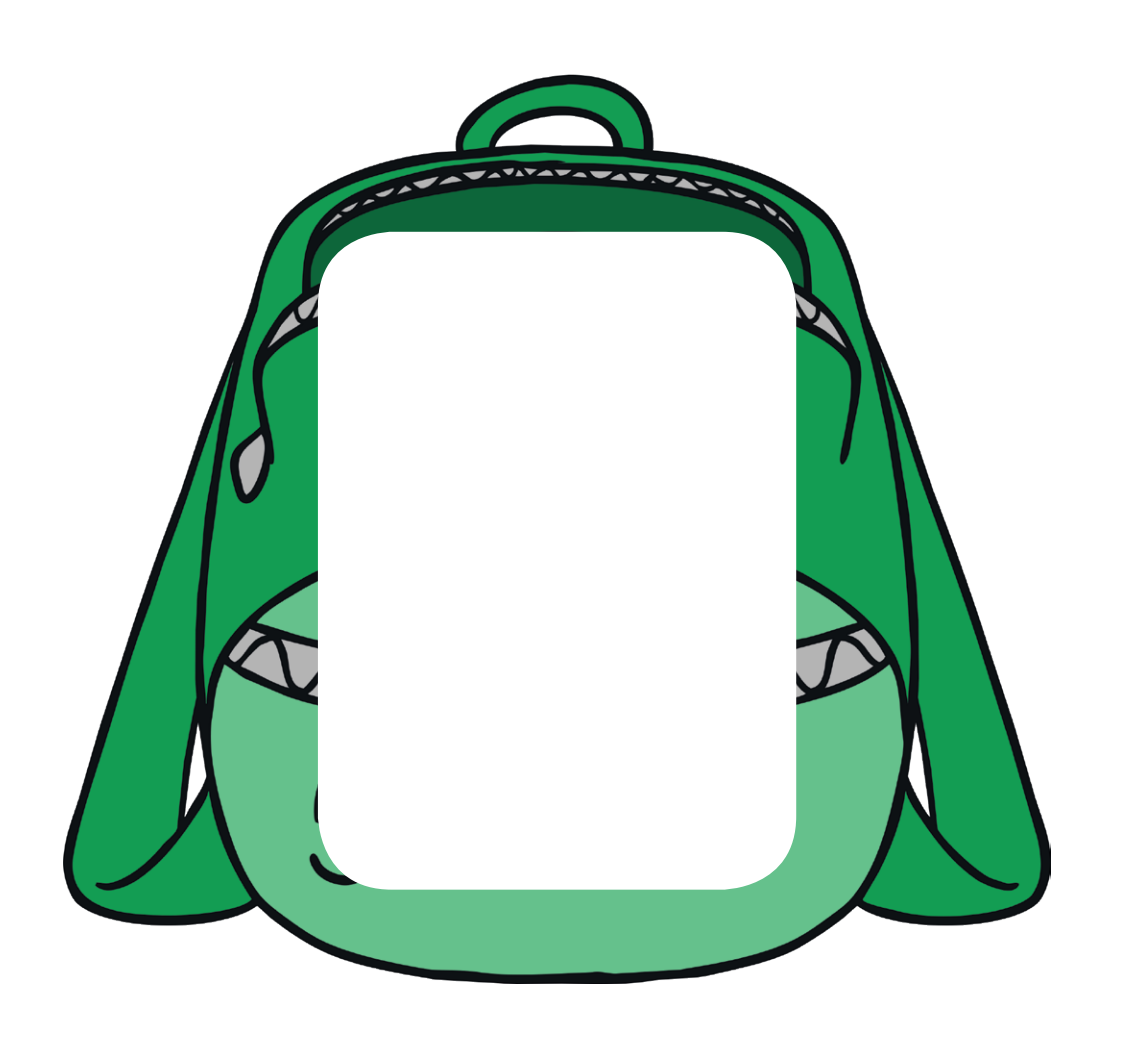
Nonsense ou words