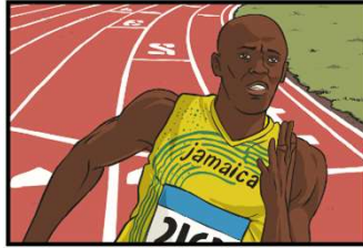
Usain Bolt: winner of three Olympic gold medals in London

Although other athletes have won more medals than Bolt, including American sprinter Carl Lewis who was commentating for a television network, no-one else can match the explosive power and unrivalled pace exhibited by Bolt.