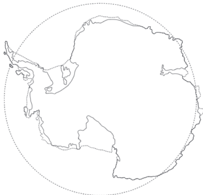
map of Antartica